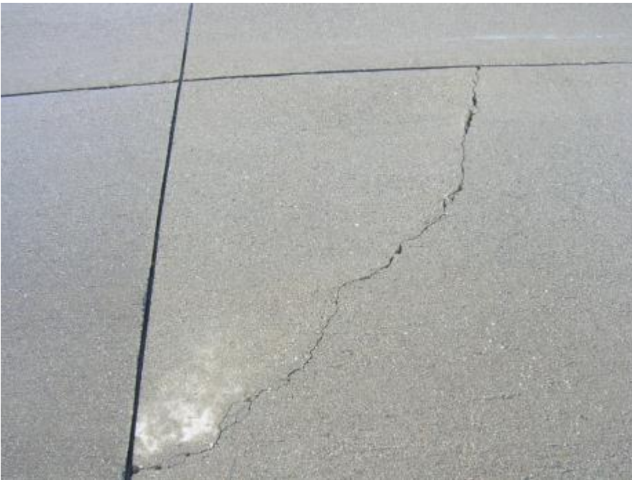
Photo 16. Taxiway A, Section T20C, Medium Severity Corner Break.