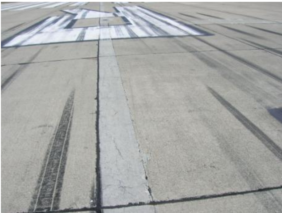
Photo 8. Runway 14L, Section R04A, Medium Severity Large Patch