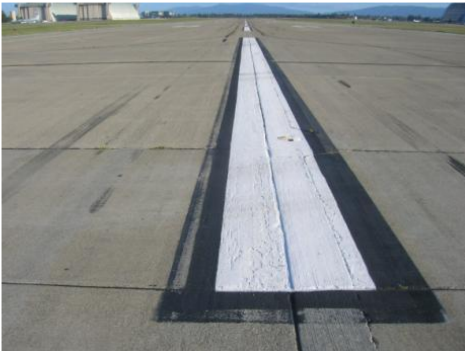
Photo 6. Runway 14L, Section R02CA, Overview