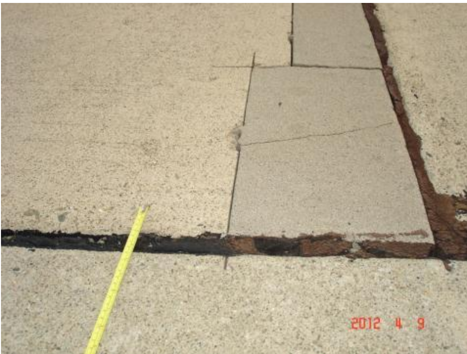
Photo 14. Runway 32L, Section R11A, wide joint opening recommended for repair.