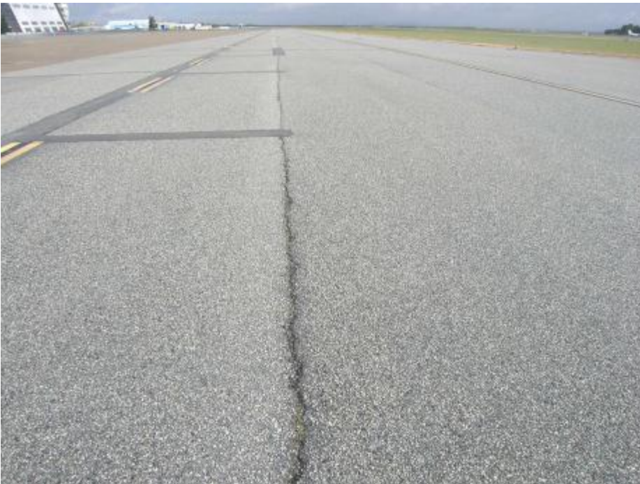
Photo 20. West Taxiway, Section T17A, Low to Medium Linear Cracking.