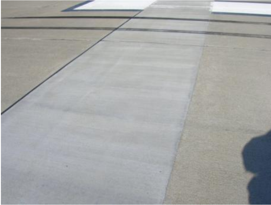
Photo 7. Runway 14L, Section R03C, Low Severity Large Patch.