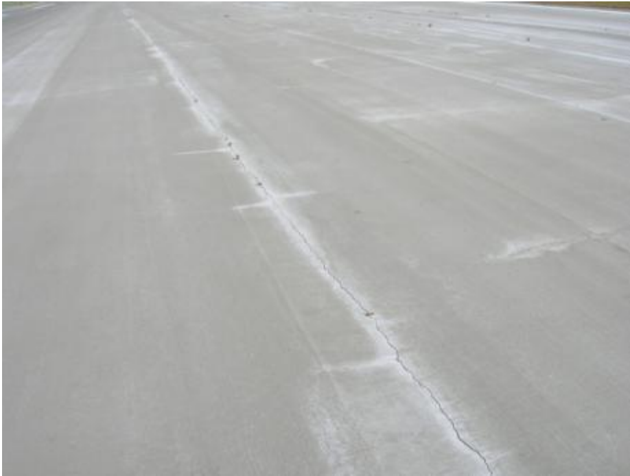
Photo 1. Runway 14R, Sections R06A and R07A, Polymer Concrete Micro-Overlay. Staining at crack.