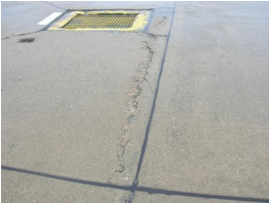
Photo 9. West Apron, Section A20B, High Severity Linear Transverse Diagonal Cracking.