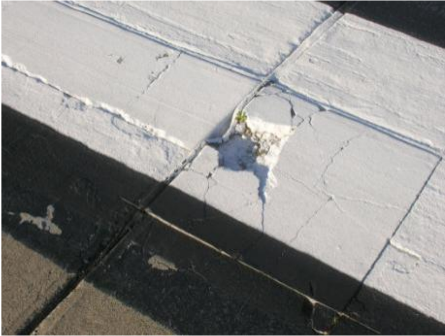
Photo 5. Runway 14L, Section R01A, Sample unit 25, High Severity Small Patch.