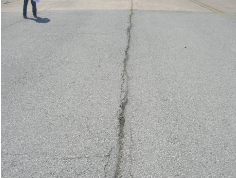
Photo 17. East Taxiway, Section T02A, Low to High Severity Linear Cracking.