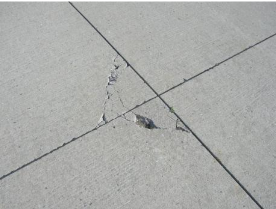
Photo 18. East Taxiway, Section T04A, High Severity Corner Spall.