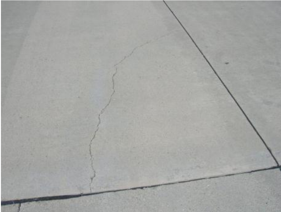
Photo 15. Taxiway B, Section T21C, Low Severity Corner Break.