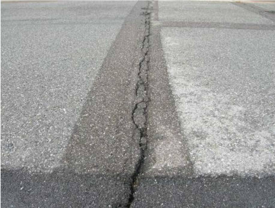
Photo 19. West Taxiway, Section T17A, Medium to High Linear Cracking.