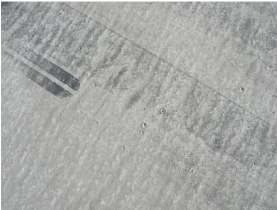
Photo 4. Runway 14R, Section R06A, Polymer Concrete Micro-Overlay, Surface Finishing .