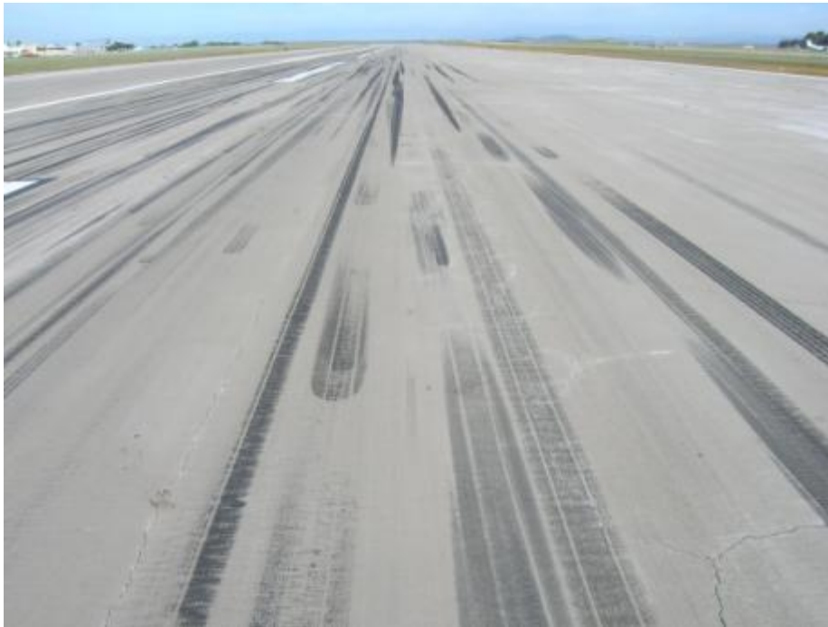
Photo 2. Runway 14R, Sections R06A and R07A, Polymer Concrete Micro-Overlay, Cracking.