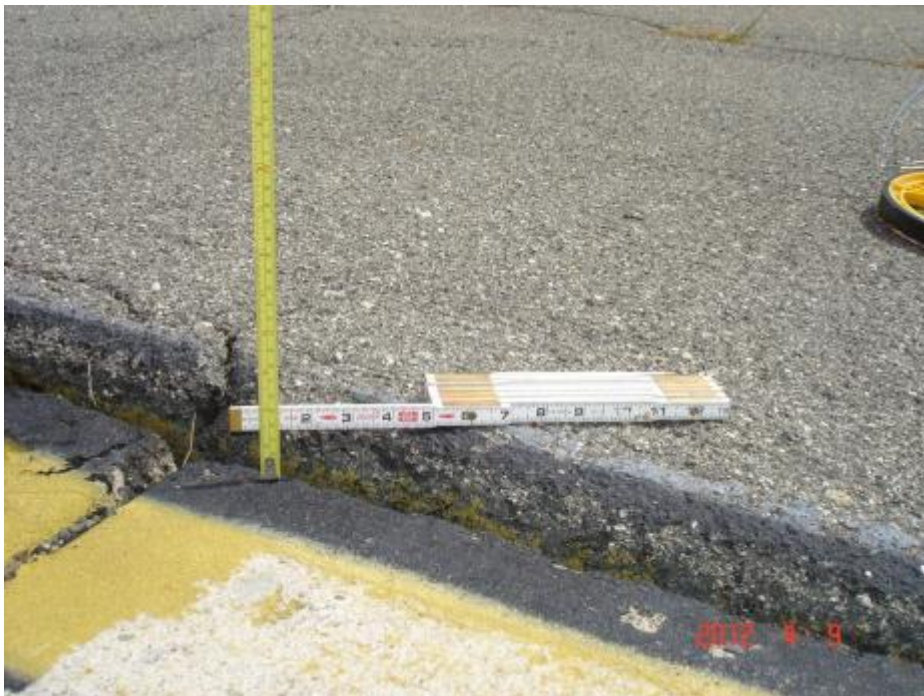
Photo 13. Runway 32L, Section R11A, wide joint between AC and PCC.