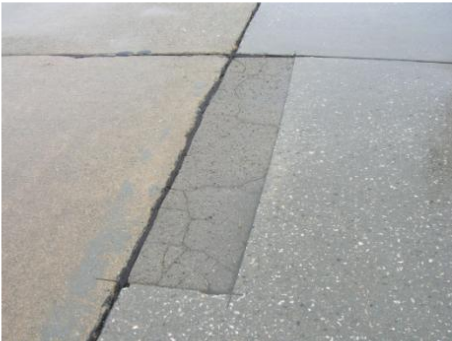
Photo 10. West Apron, Section A22B, Medium Severity Large Patch.