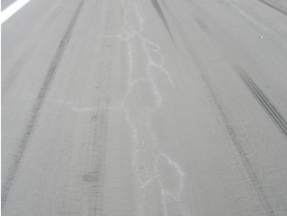
Photo 3. Runway 14R, Sections R06A and R07A, Polymer Concrete Micro-Overlay. Cracking.