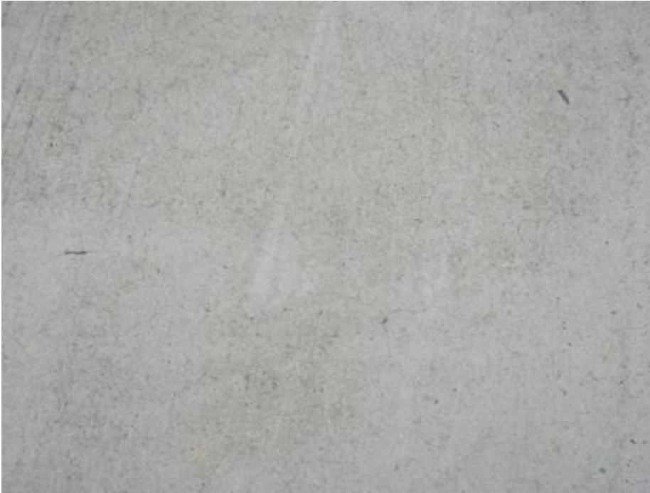
Photo 11. West Apron, Section A22B, Low Severity Scaling/Map Crazing.